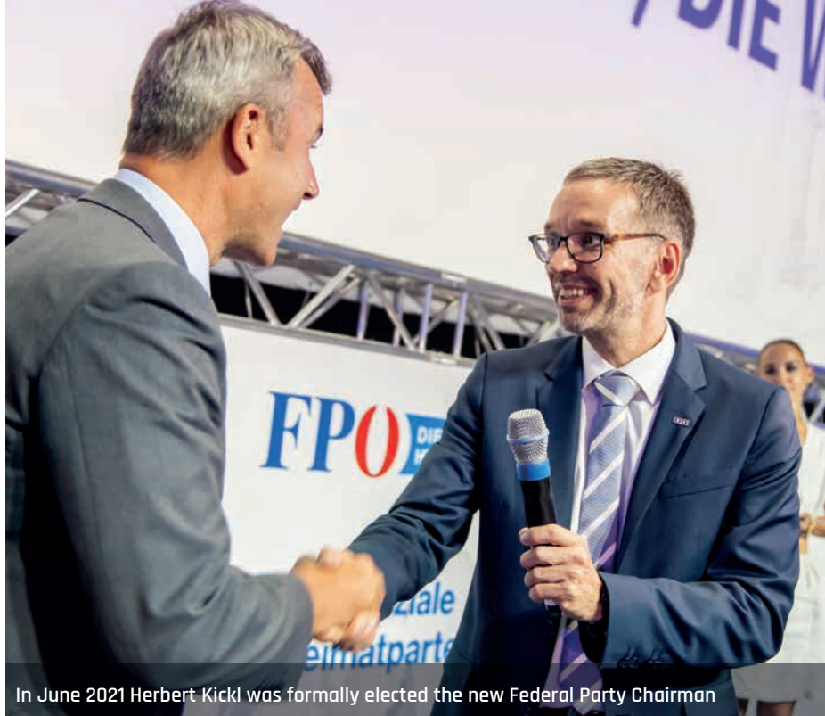
In June 2021 Herbert Kickl was formally elected the new Federal Party Chairman