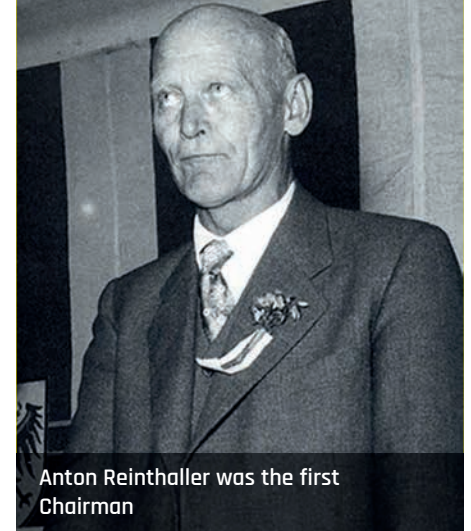
Anton Reinthaller was the first Chairman

It is worth adding in this connection that Anton Reinthaller remains a figure of controversy. Born in Upper Austria, Reinthaller was considered after the war to have been one of the former high-ranking National Socialists in Austria. He had for example served as Minister of Agriculture in the "Anschluss Government" installed by Hitler's Germany and led by Chancellor Arthur Seyß-Inquart. For some, the committed Catholic was considered an "idealist" who had played no part in the crimes of National Socialism. For others, however, he was also a former SS Brigade Leader, who had already been agitating for the Anschluss of Austria to Germany whilst that was still illegal. But the FPÖ's hope that by adopting a markedly national party line it could build on the successes of the Third Lager during the inter-war period and obtain up to 18 percent of the vote in National Council elections was not fulfilled. At the National Council elections of May 1956, the FPÖ obtained only 6.5 percent of the vote and six National Council seats.