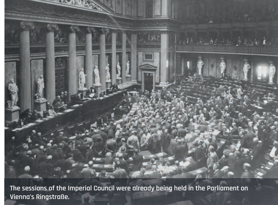
The sessions of the Imperial Council were already being held in the Parliament on Vienna's Ringstraße.

The national-liberals were by far the strongest force in the Austrian Imperial Council, where they were opposed by the Catholic Conservatives. Their advocacy on behalf of the German-speaking population of the Monarchy also fuelled conflict with the Slavs. For, despite the fact that the Habsburgs had for centuries played a leading role in German affairs, Austria had since the 1866 Austro-Prussian