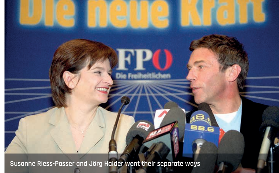
Susanne Riess-Passer and Jörg Haider went their separate ways

At a meeting convened in Knittelfeld, Styria, party delegates approved the demand for an extraordinary party conference and did so very much against the wishes of FPÖ Vice-Chancellor, Susanne Riess-