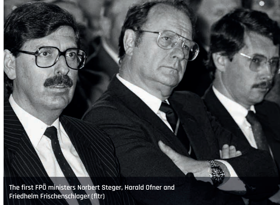
The first FPÖ ministers Norbert Steger, Harald Ofner and Friedhelm Frischenschlager (fltr)

Norbert Steger was shaped by the "Atterseekreis". Founded in 1971 under the party leadership of Friedrich Peter to strengthen the liberal wing within the FPÖ, it continues to this day to provide important intellectual stimulation for the party.