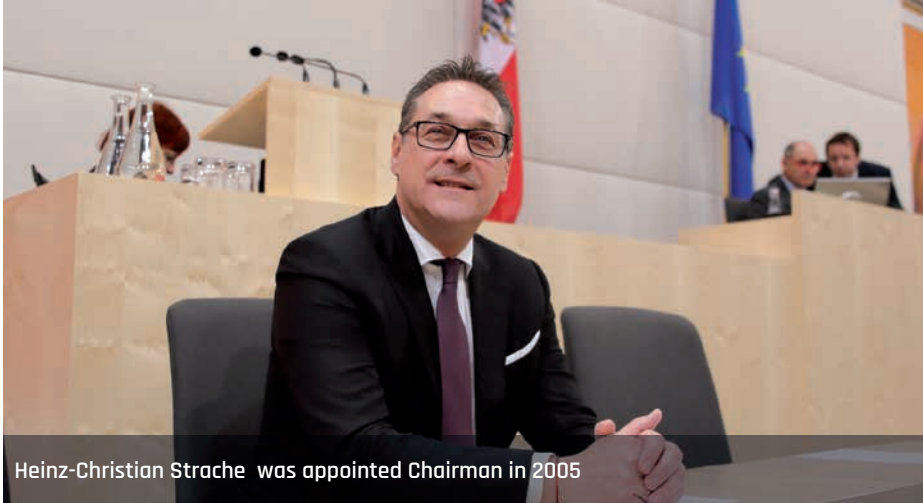
Heinz-Christian Strache was appointed Chairman in 2005