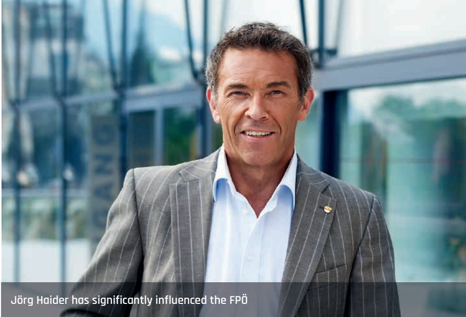
Jörg Haider has significantly influenced the FPÖ