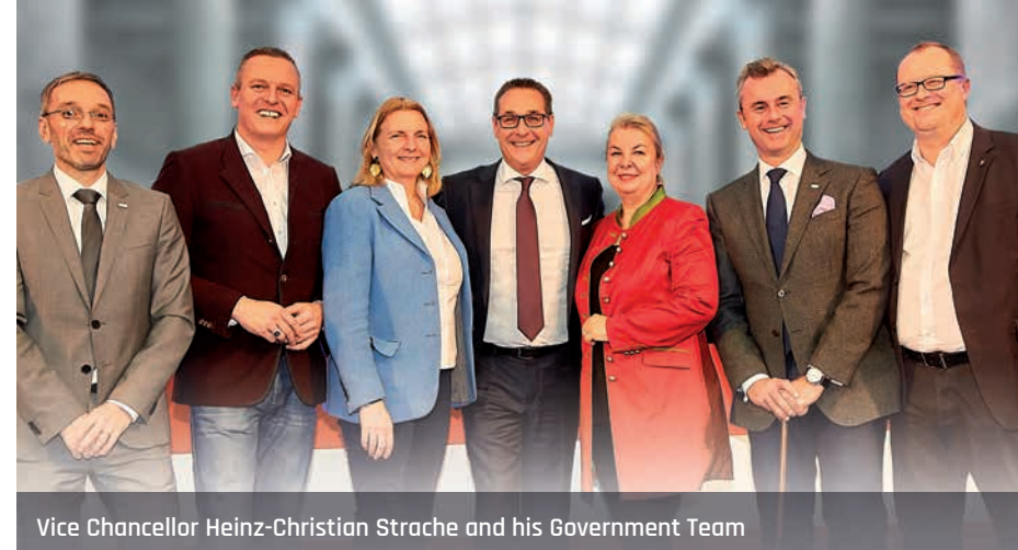
Vice Chancellor Heinz-Christian Strache and his Government Team

FPÖ Federal Party Chairman Heinz-Christian Strache became Vice Chancellor and Federal Minister for the Civil Service and Sport. Five further cabinet ministers and one junior minister (state secretary) were also provided by the FPÖ. The newly-sworn-in Federal Minister for Europe, Integration and Foreign Affairs was Karin Kneissl, a