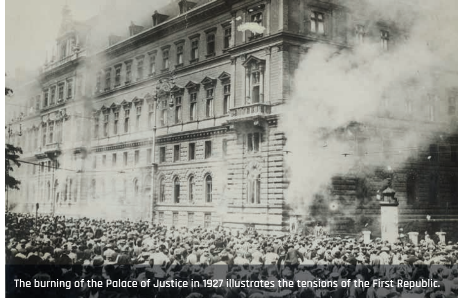
The burning of the Palace of Justice in 1927 illustrates the tensions of the First Republic.

In the First Republic, the Christian Socials and Social Democrats created the Heimwehr and the Republikanischer Schutzbund as paramilitary organisations. Conditions akin to a civil war culminated in the burning of the Palace of Justice in Vienna.