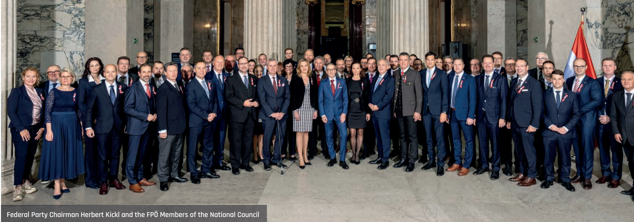
Federal Party Chairman Herbert Kickl and the FPÖ Members of the National Council